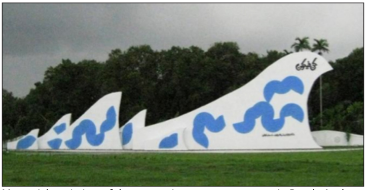
Memorial to victims of the tsunami covers a mass grave in Banda Aceh.

When teaching theory, I tell my students how very much our analytical frameworks matter. They are not just abstract "academic" constructions, but models – implicit and explicit – for action in the world. Positive peace, gender sensitivity, structural violence, transitional justice: how one imagines and enacts such ideas has intense mate-