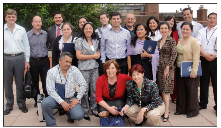
Workshop Participants.

The project has had a significant impact on the development of conflict resolution/transformation in the Latin American region. The planning team has been able to track the development and maturation of the