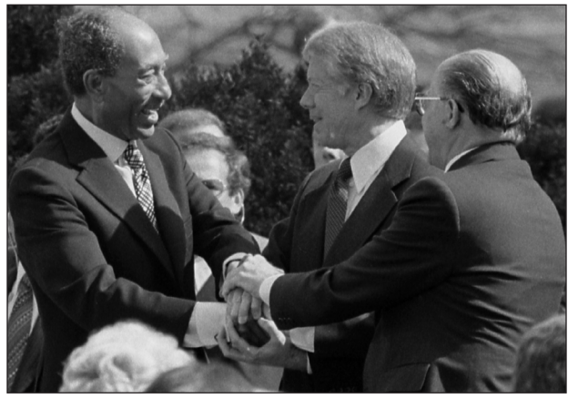
Anwar Sadat, Jimmy Carter, and Menachem Begin agree the Egypt-Israeli Peace Treaty, 1979

Breyer also jumped on a key argument made by Kagan and accepted by the majority – perhaps, in a deeply political sense, the most important point of all – that training in nonviolent processes might legitimize terrorist organizations. The government wants to make certain organizations "radioactive," as